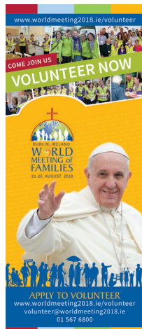
Volunteer Pull Up Banner