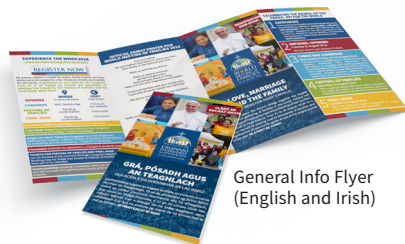
General Info Flyer (English and Irish)