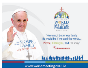
Standard Curved Banner

NOTE: More products and designs will be produced in the coming months. New order forms will be available on www.worldmeeting2018.ie