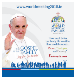
Wide Pull Up Banner