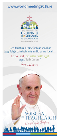
Standard Pull Up Banner (Irish)